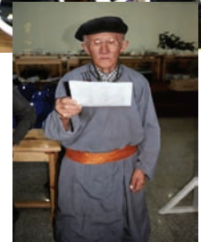
A man in Mongolia tries out his new readers