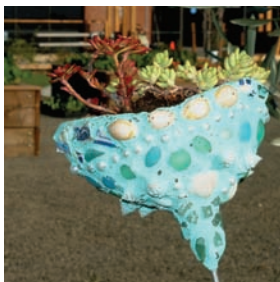
Succulents fill a mosaic planter pod, created by BI artists, at Jason's Garden.