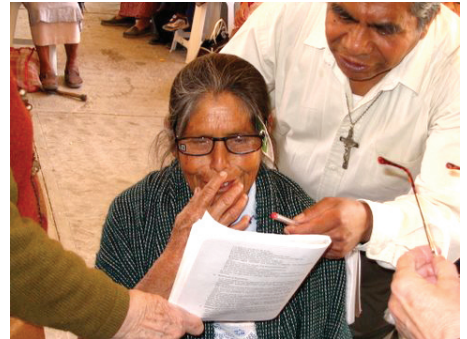
In Honduras, a woman sees the difference