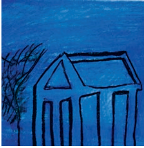
Imagery Estate Winery picks Ali Koehler's art for wine label