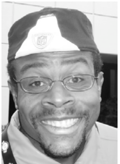
Damon Blackwell Photographer